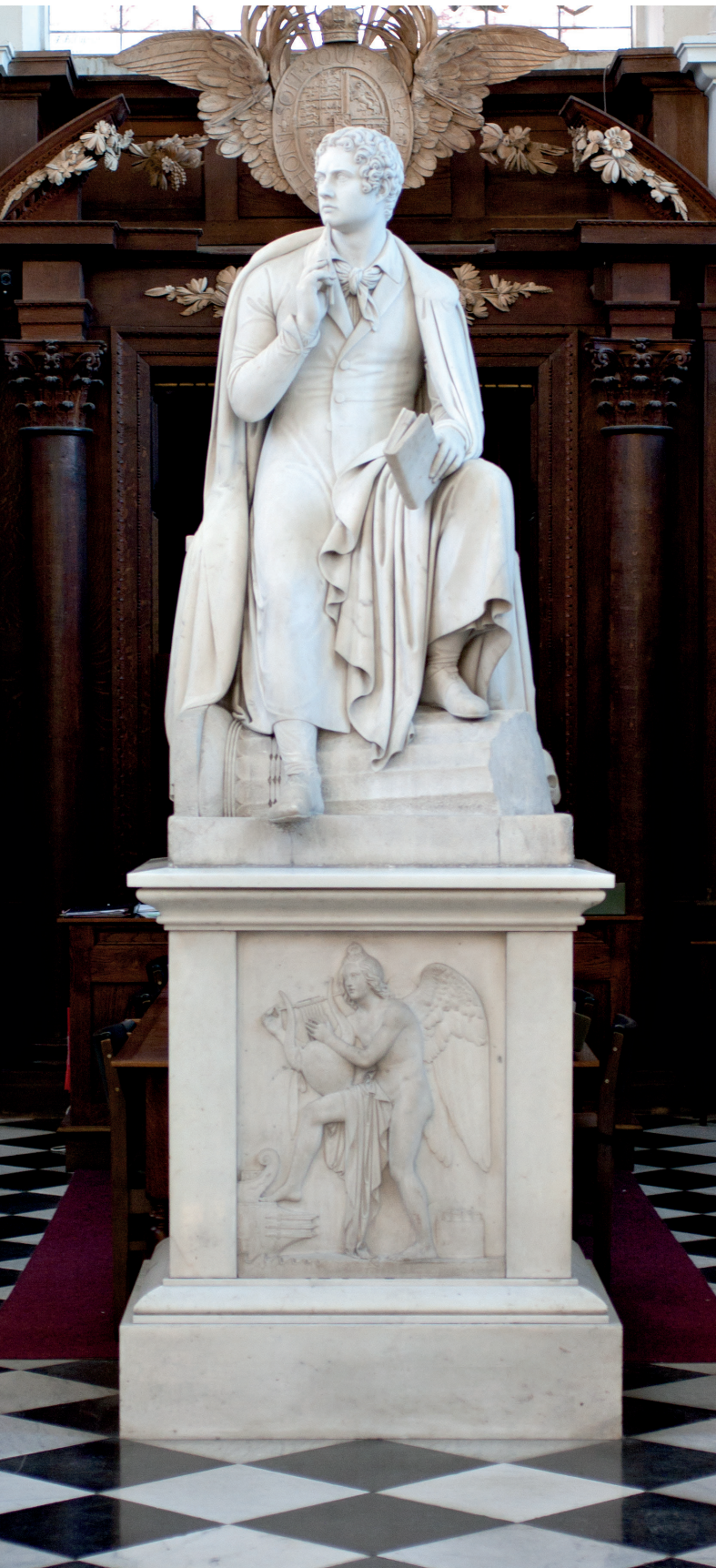
The Byron statue as it can be seen in the Wren Library today TRINITY COLLEGE CAMBRIDGE