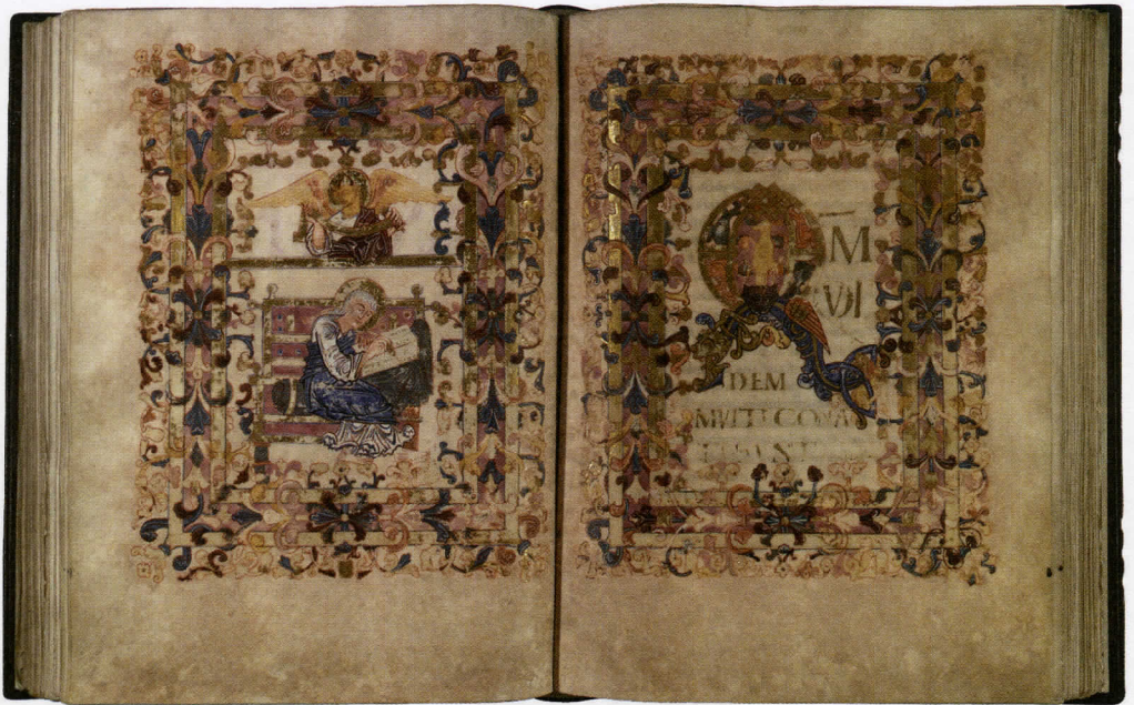
The opening of the Gospel of Luke, showing Luke writing at his desk, in an early 11 th century English Gospel book (MS B.10.4, ff.89v-90r)