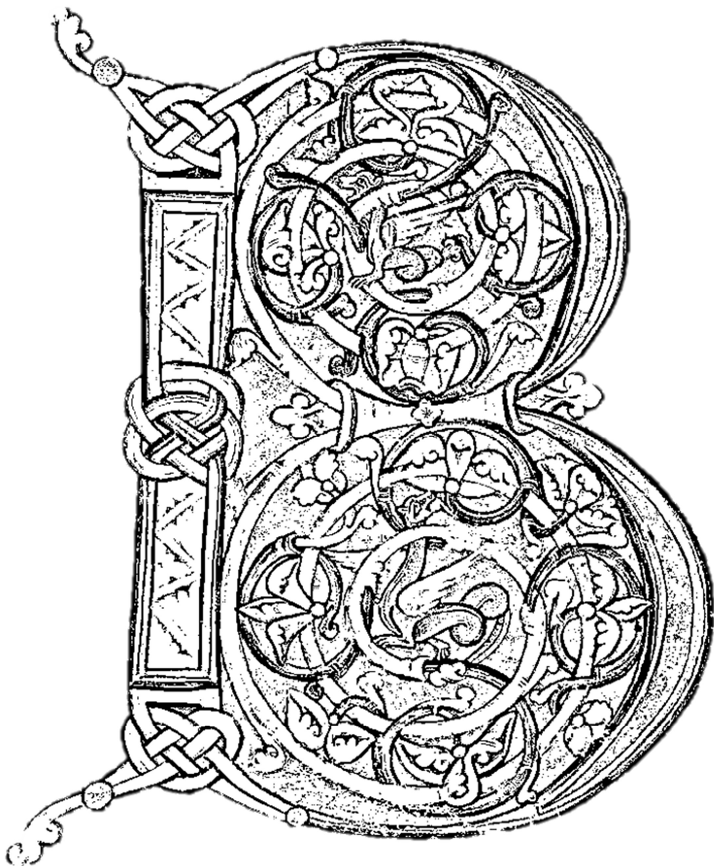
Tripartitum Psalterium Eadwini (The Canterbury Psalter), 12 th century. Trinity Ms. R.17.1, f. 6r. Digitised version: https://mss-cat.trin.cam.ac.uk/manuscripts/uv/view.php?n=R.17.1 .