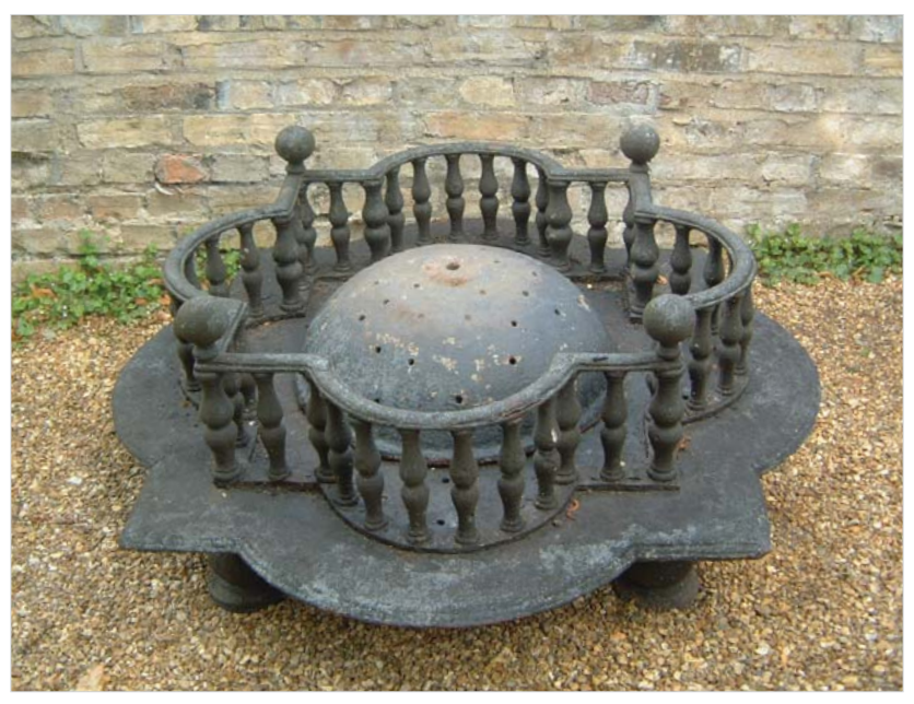
The brazier formerly used to heat the Hall