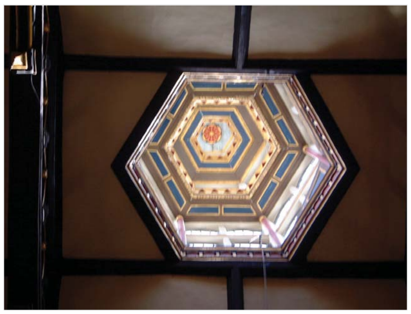
The Hall lantern seen from below