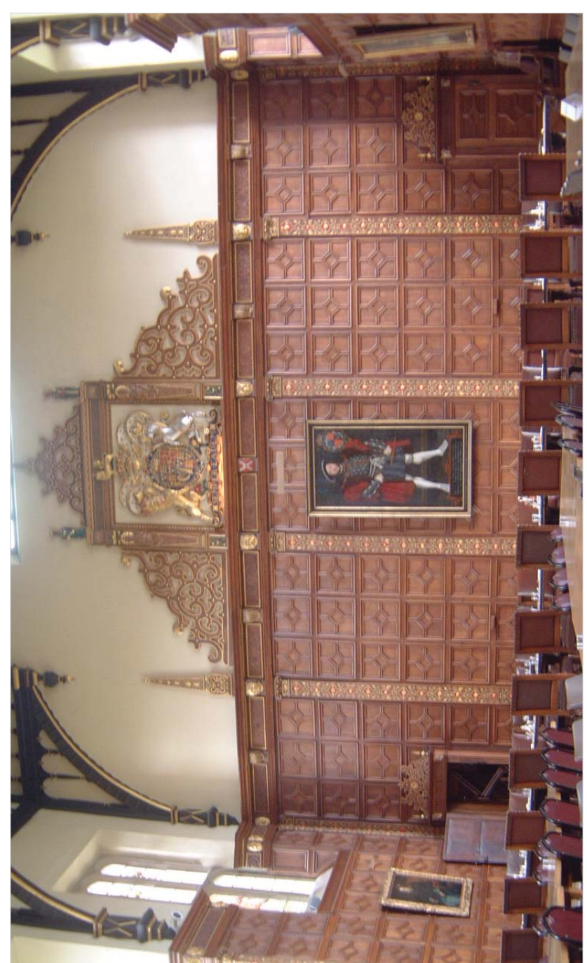
The Hall interior