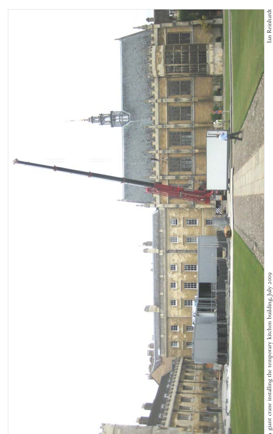
A giant crane installing the temporary kitchen building, July 2009