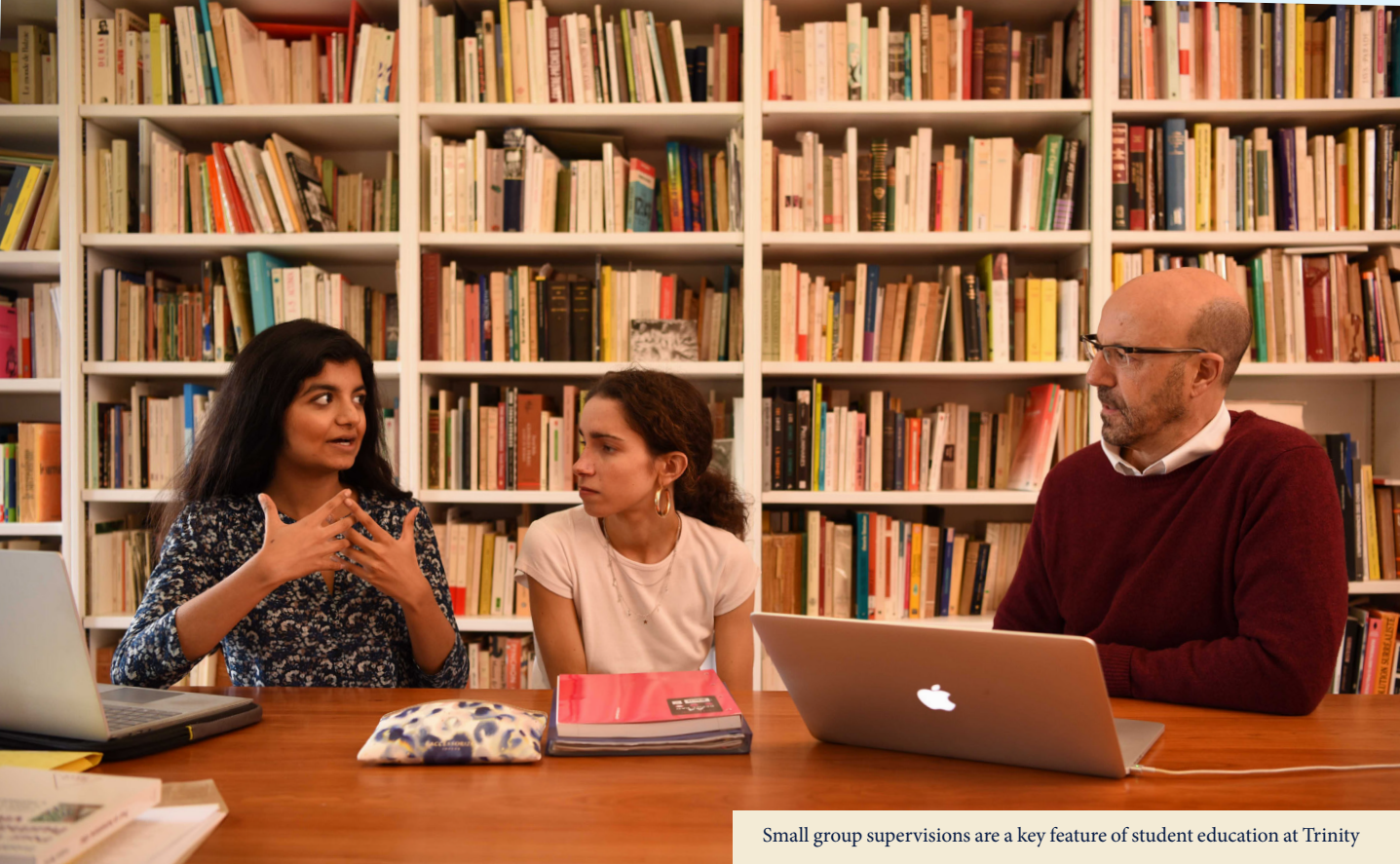
Small group supervisions are a key feature of student education at Trinity

New students often imagine that a supervision simply involves the work being marked 'right' or 'wrong', but that is not what happens at all. A Cambridge supervision is an in-depth, personalised opportunity to learn alongside a subject expert. The supervisor may praise a solution, may say that a solution is correct but show a simpler approach, may correct an error, may quiz the students on part of their course, may explain to the students 'where the course goes next', and so on.