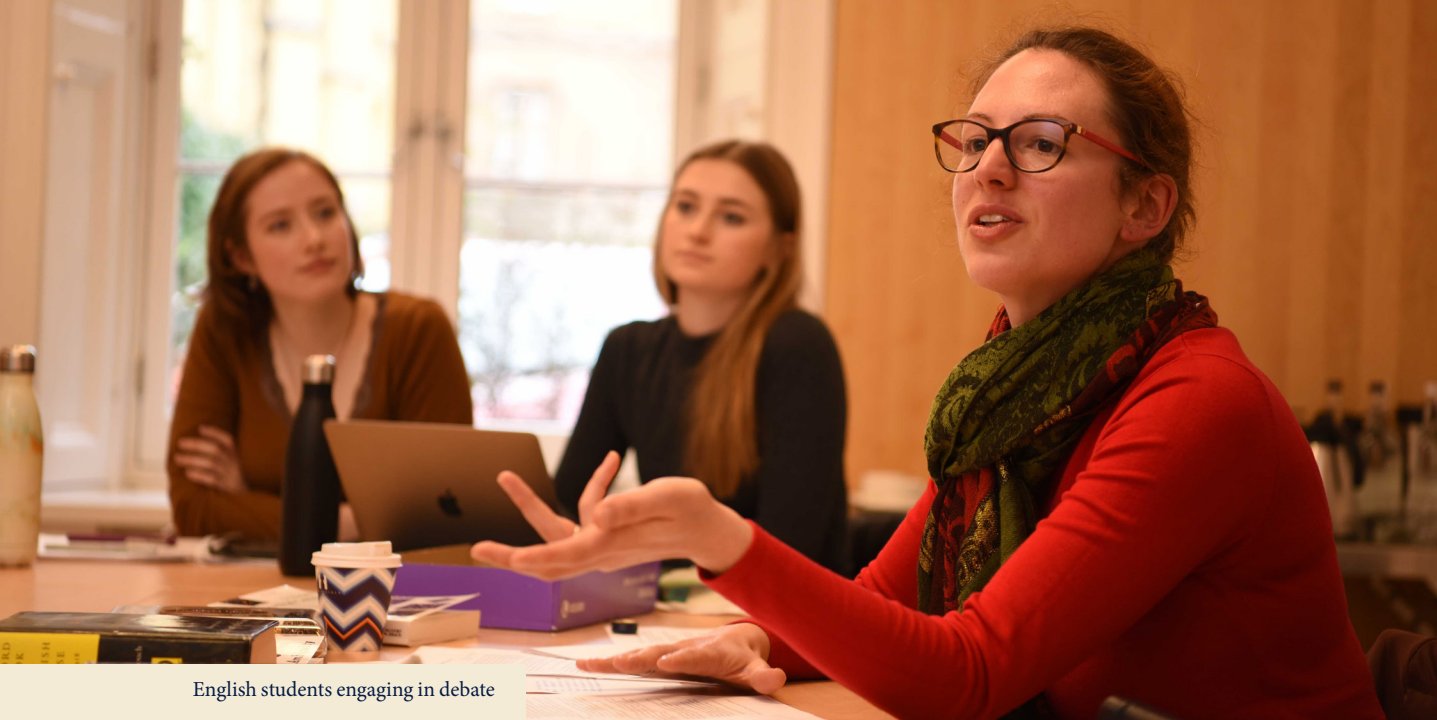
English students engaging in debate

Famous figures in the arts and humanities in Trinity's history include the writers Lord Byron, Alfred Lord Tennyson, Vladimir Nabokov, and AA Milne; historians GM Trevelyan, EH Carr, and Norman Stone; philosophers Ludwig Wittgenstein and Bertrand Russell; composers Ralph Vaughan Williams and Charles Villiers Stanford; and classicists AE Housman and Richard Porson.