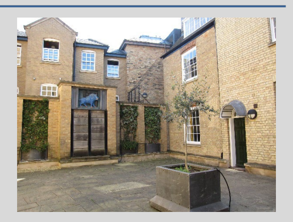
Several staircases within Blue Boar are designated as Side F areas. These rooms all have shared bathroom facilities.