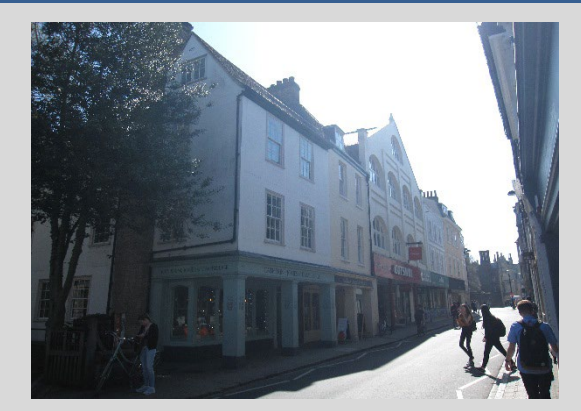
We reserve a set amount of rooms in Pearce Hostel for Side F students. These rooms are located above the shops in Bridge Street. The majority are en suite, and have access to full kitchens with ovens and hobs.