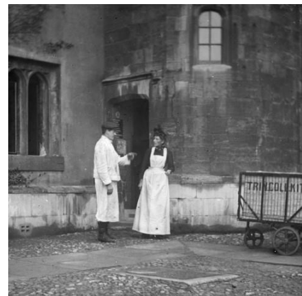
College Servants in Great Court