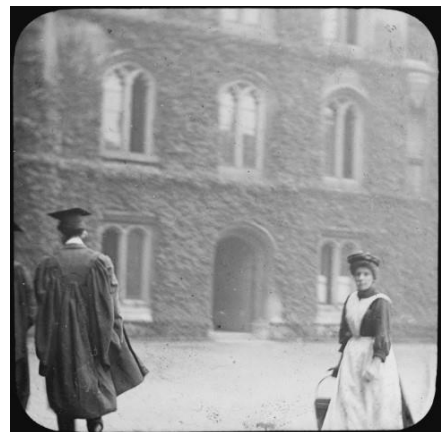
Servant and Student in New Court

As to be expected with people who see each other on a near-daily basis, many students and resident Fellows form close friendships with their bed-makers. Influential twentieth-century economist Piero Sraffa was one such person, whose personal letters, in the Wren Library, contain notes left for him by his bed-maker. Sraffa joined the University as a lecturer after migrating to England from Italy. After resigning his post as a lecturer in 1930 he was appointed Marshall librarian, and shortly afterwards became the assistant director of research to